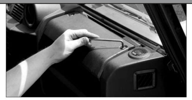
1. Remove panel bolts