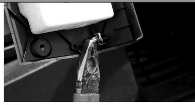
2. Remove clips and styrofoam