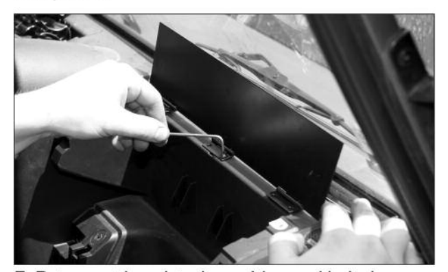
5. Put mounting plate in position and bolt down