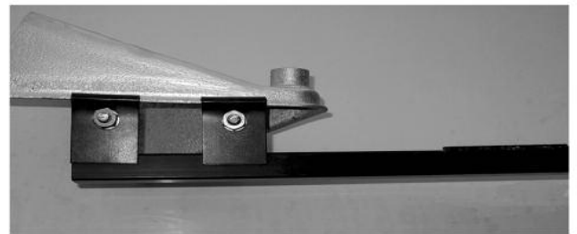
FRONT CHASSIS MOUNTING ARRANGEMENT